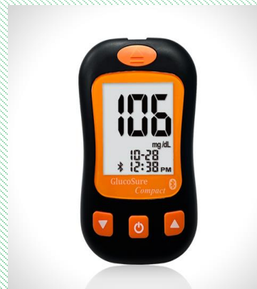
Glucose POC link