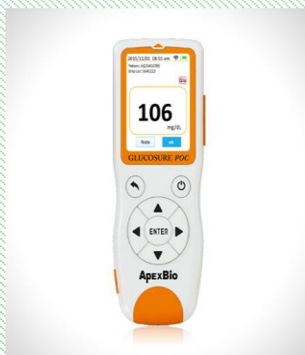
G/K POC wifi