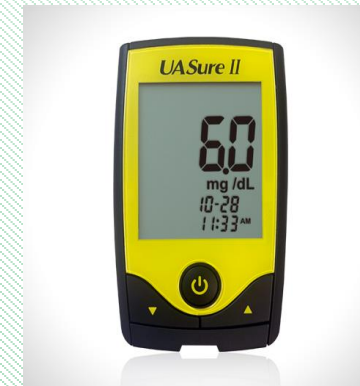
Uric Acid link